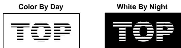
Figure 1. Example of Color By Day/White By Night

The following example is a Color By Day / White By Night graphic, which is typical of a construction that requires three film layers. See Figure 1.